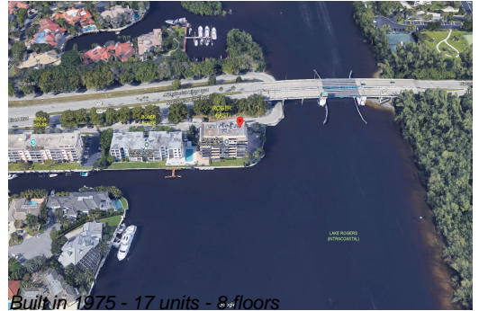
Built in 1975 - 17 units - 8 floors

The above valuated price is a baseline figure that does not take into account any specific renovation, upgrade, split, merge, or deterioration of the unit.