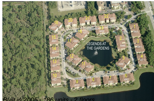
Built in 2005 - 186 units - 2 floors