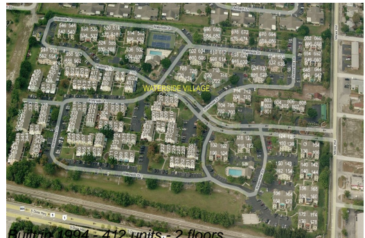
Built in 1994 - 412 units - 2 floors