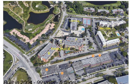
Built in 2004 - 99 units - 5 floors