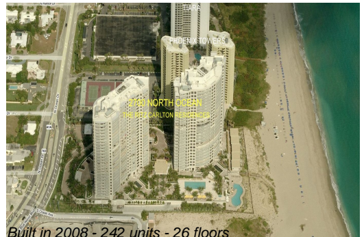
Built in 2008 - 242 units - 26 floors