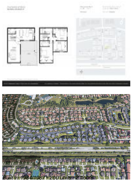
Built in 1984/1987 - 200 units - 2 floors