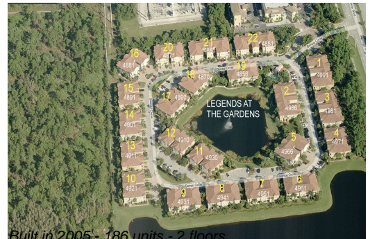
Built in 2005 - 186 units - 2 floors