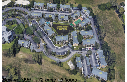
Built in 1990 - 172 units - 3 floors

The above valuated price is a baseline figure that does not take into account any specific renovation, upgrade, split, merge, or deterioration of the unit.