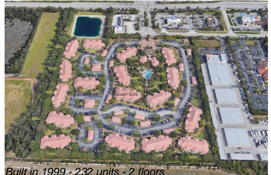
Built in 1999 - 232 units - 2 floors