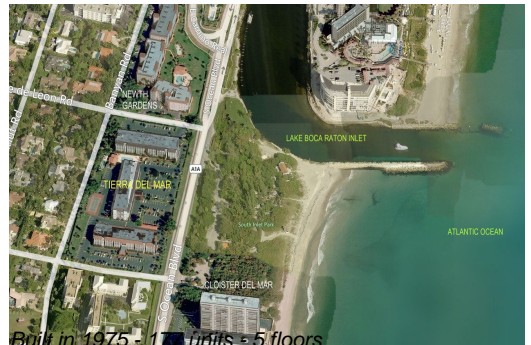
Built in 1975 - 177 units - 5 floors