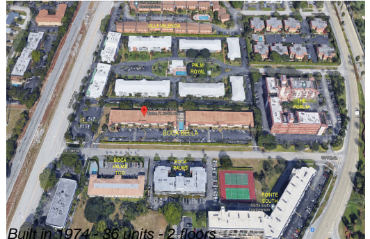
Built in 1974 - 36 units - 2 floors