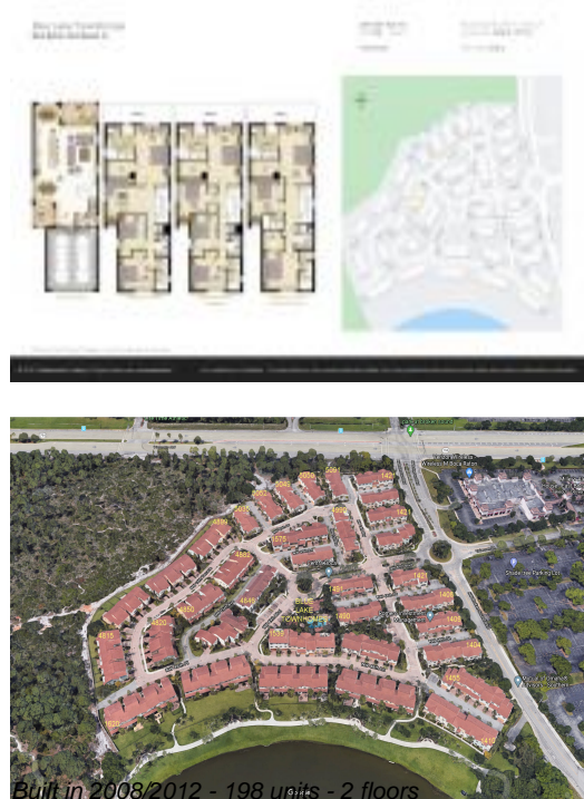
Built in 2008/2012 - 198 units - 2 floors