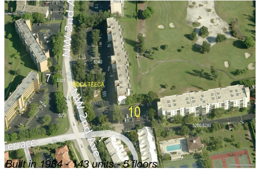
Built in 1984 - 143 units - 5 floors