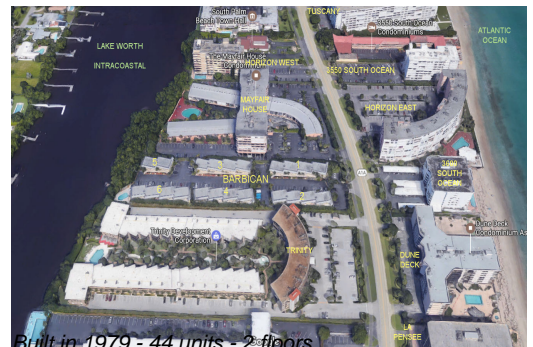
Built in 1979 - 44 units - 2 floors