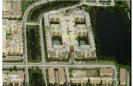
Built in 2007 - 328 units - 6 floors