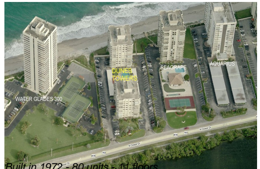
Built in 1972 - 80 units - 11 floors