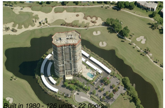
Built in 1980 - 126 units - 22 floors