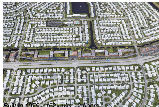
Built in 1979 - 152 units - 2 floors