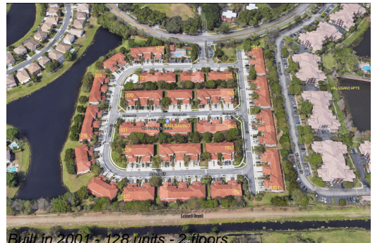
Built in 2001 - 128 units - 2 floors