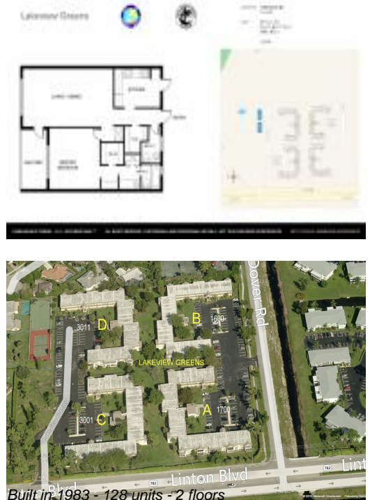
Built in 1983 - 128 units - 2 floors