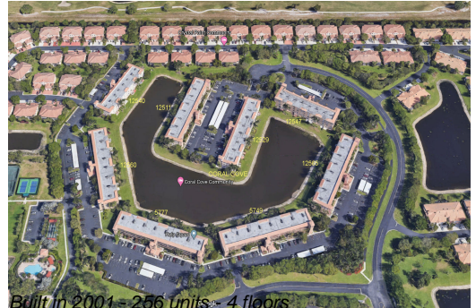
Built in 2001 = 256 units = 4 floors