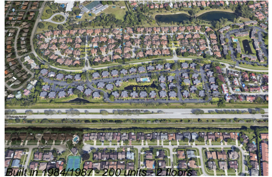
Built in 1984/1987 - 200 units - 2 floors