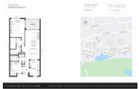
Built in 1981/1991 - 168 units - 7 floors

The above valuated price is a baseline figure that does not take into account any specific renovation, upgrade, split, merge, or deterioration of the unit.