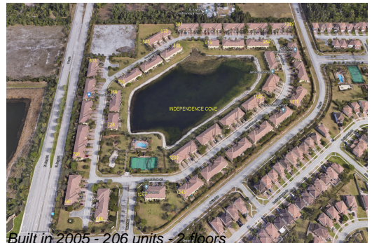
Built in 2005 - 206 units - 2 floors