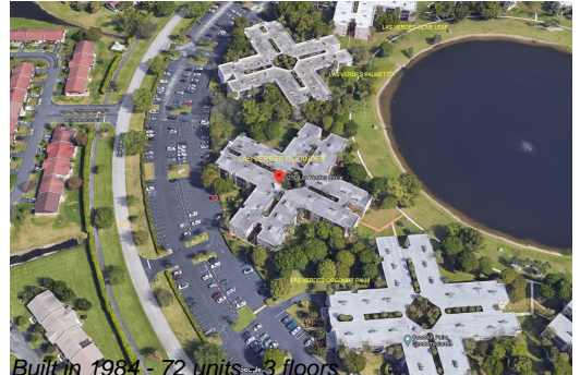
Built in 1984 - 72 units - 3 floors.