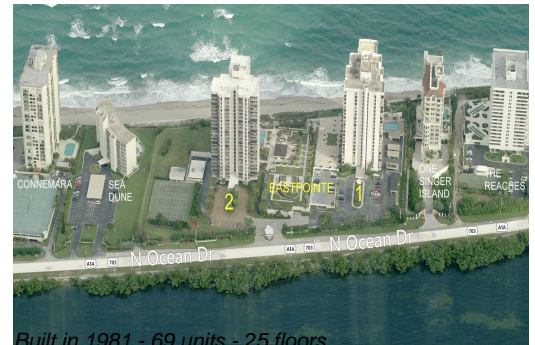
Built in 1981 - 69 units - 25 floors