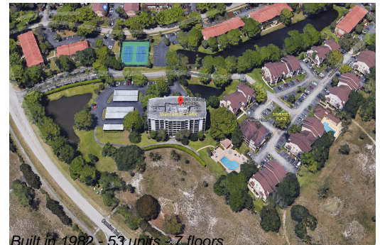
Built in 1982 - 53 units - 7 floors