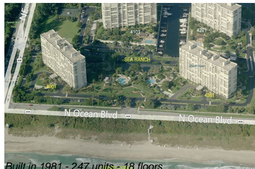
Built in 1981 - 247 units - 18 floors