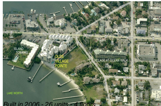
Built in 2006 - 26 units - 4 floors