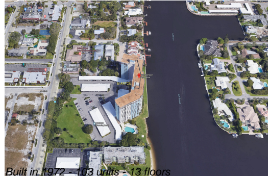
Built in 1972 - 103 units - 13 floors