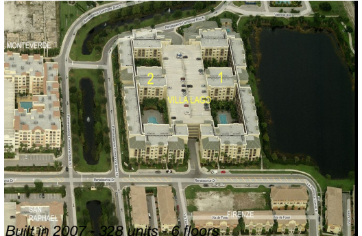
Built in 2007 - 328 units - 6 floors