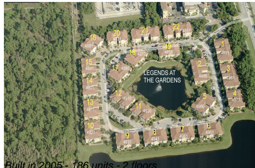
Built in 2005 - 186 units - 2 floors