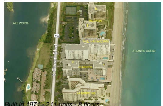
Built in 1971 - 211 units - 8 floors