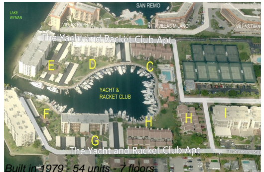
Built in 1979 - 54 units - 7 floors