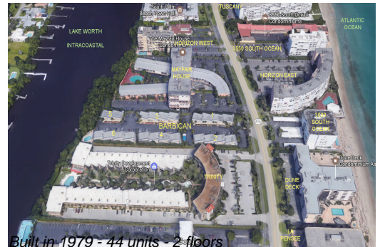
Built in 1979 - 44 units - 2 floors