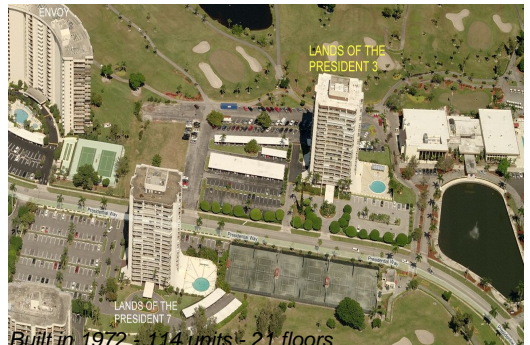
Built in 1972 - 114 units - 21 floors