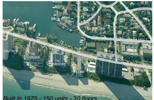
Built in 1975 - 150 units - 20 floors