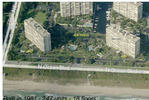
Built in 1981 - 247 units - 18 floors