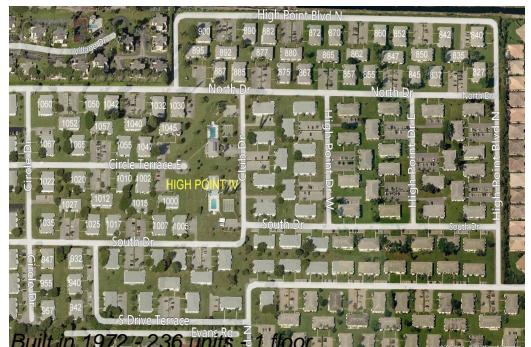
Built in 1972 - 236 units - 1 floor