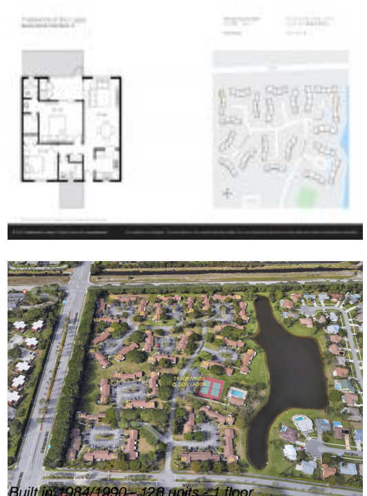
Built in 1984/1990 - 128 units - 1 floor