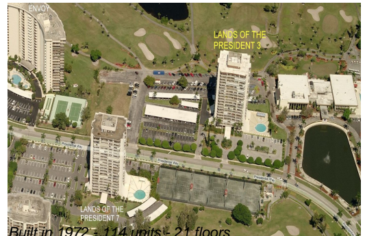
Built in 1972 - 114 units - 21 floors