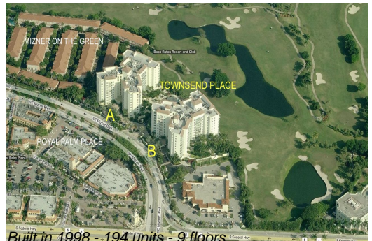
Built in 1998 - 194 units - 9 floors