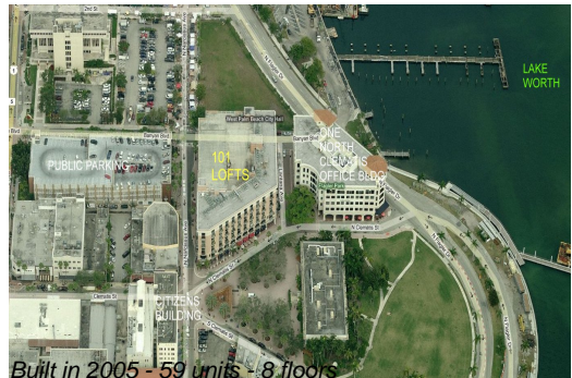
Built in 2005 - 59 units - 8 floors