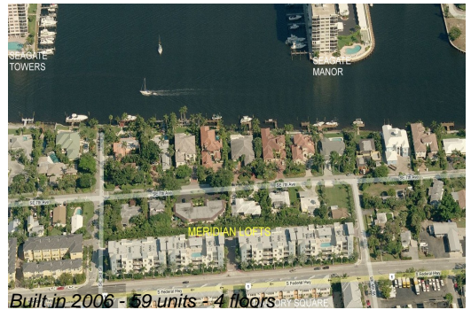
Built in 2006 - 59 units - 4 floors