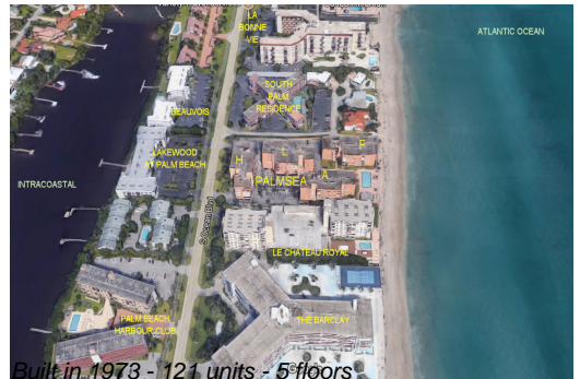
Built in 1973 - 121 units - 5 floors