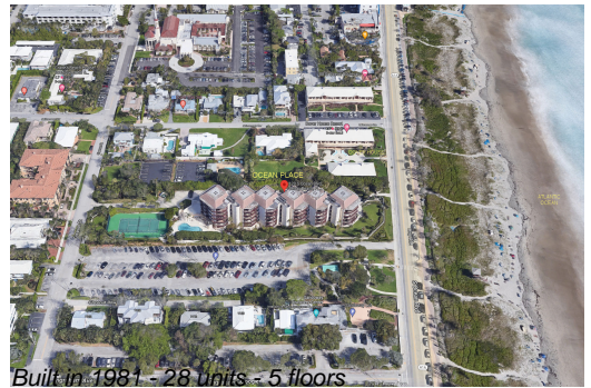
Built in 1981 - 28 units - 5 floors

The above valuated price is a baseline figure that does not take into account any specific renovation, upgrade, split, merge, or deterioration of the unit.