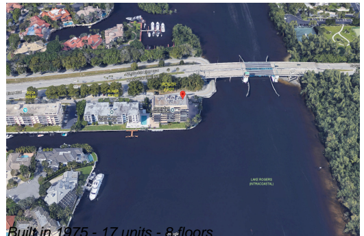
Built in 1975 - 17 units - 8 floors