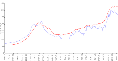
Eastpointe I vs Singer Island