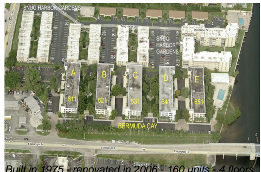
Built in 1975 - renovated in 2006 - 160 units - 4 floors