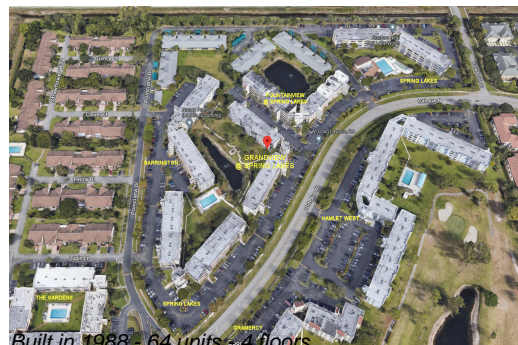
Built in 1988 - 64 units - 4 floors